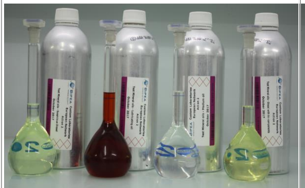
Proficiency test on mineral oils