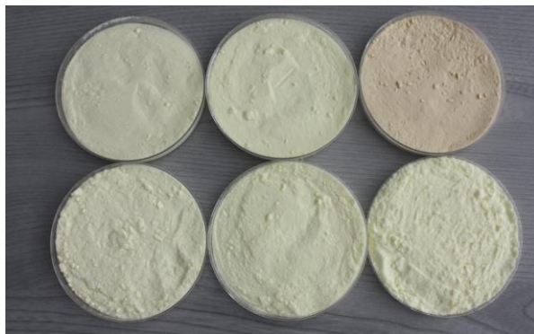
Ring test on milk products