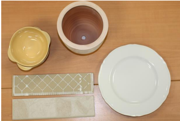
Ring test on ceramics and pottery