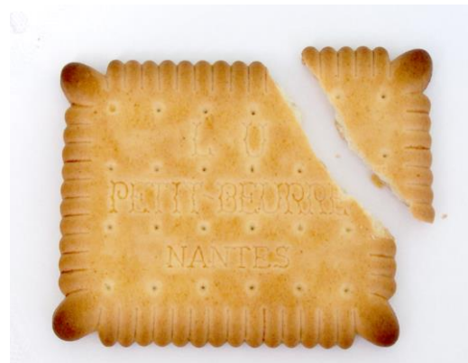
Proficiency test related to Meursing table