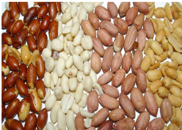
Ring test on nuts and seeds