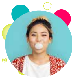
13-17 years old