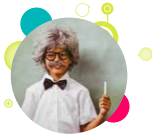
9-12 years old