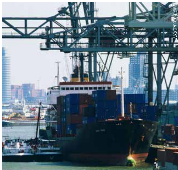
Rotterdam harbour: Europe's largest door to world trade.

At the same time, European tax policy aims at facilitating free movement of people, goods, services and capital. The European Commission will continue to work on eliminating tax obstacles to free trade in Europe and internationally. It will continue to help EU countries grow and prosper.