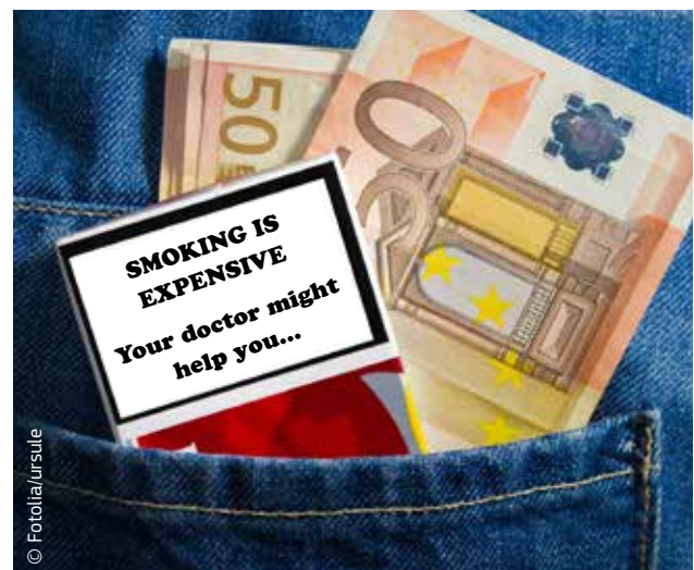
Positive side effects: excise duties on tobacco products may encourage people to stop smoking.