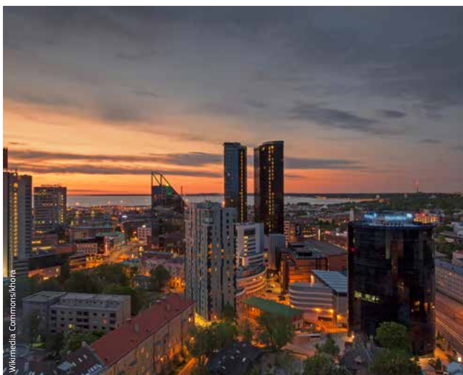
Tallinn business district: Estonia is one of the 11 countries ready to adopt a European financial transaction tax.

At present, there are no EU-wide rules on car registration and circulation taxes. Countries may levy these taxes or not, but if they do so they must apply them in a non-discriminatory way. The European Commission has published documents to clarify how general EU law impacts on EU countries’ rules on the taxation of cars moved from one country to another. The European Commission has also made recommendations to improve the functioning of the internal market, in particular to avoid double taxation of cars moved from one EU country to another and to remove obstacles to cross-border car rentals.