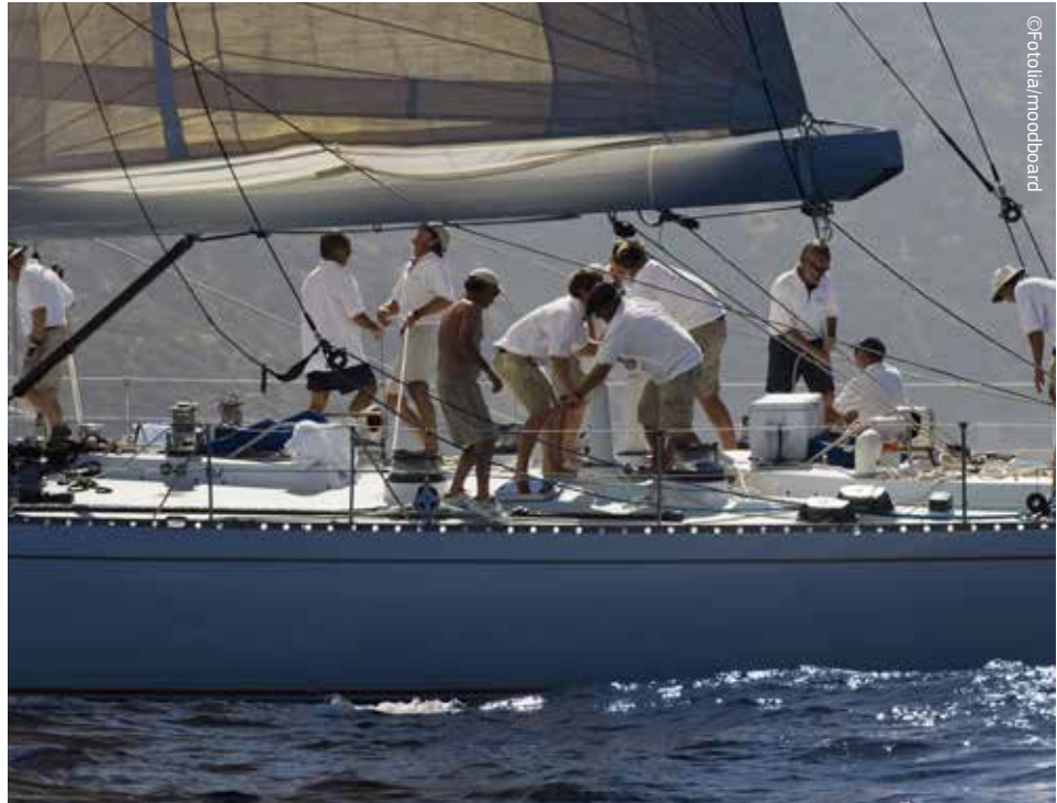
Racing for better taxation in Europe: cooperation is key.