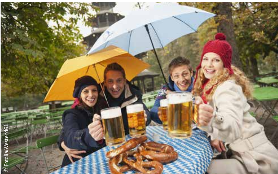
What you see: four friends having a good time in a beer garden in Munich. What you don't see: the EU fosters fair trade by harmonising excise duties on beer.

Legislation in the direct tax area is limited to bringing the different laws in each EU country more in line with each other (approximation of laws). This can only be done to the extent necessary to improve the functioning of the European Union's internal market and address common cross-border challenges such as tax evasion.