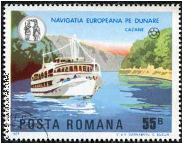
Riding a Danube liner from Germany to its mouth in Romania will bring you in touch with many different national VAT systems.