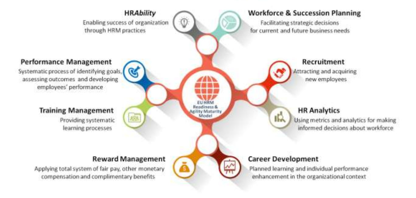
Figure 3. The EU TAX HRM-RAMM