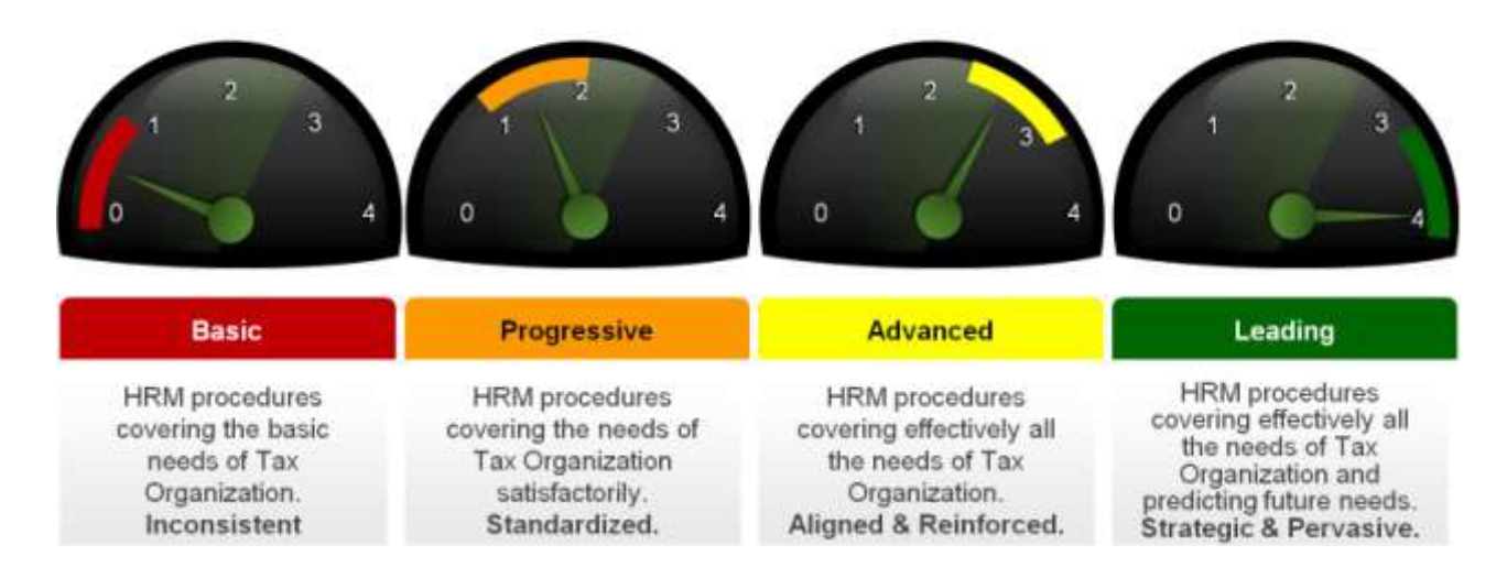
Figure 4. Levels of the EU TAX HRM-RAMM

A definition for each Performance Outcome Area is provided in the following table.