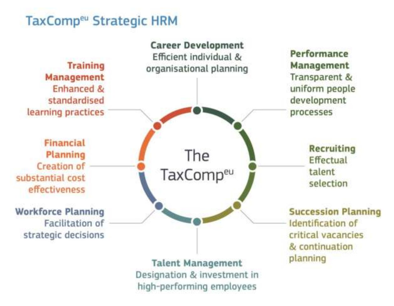
Figure 2. TaxCompeu Strategic HRM

5. A set of broad indicators were then established across the performance output areas to enable each European Tax Administration to gauge its readiness and agility level for a specific performance output area on particular indicators, e.g., Implementation and Effectiveness Indicator, and to ensure a common approach to evaluation across all PAs. Since there was a need for the model to be applied to every country, tailor-made questions were developed to