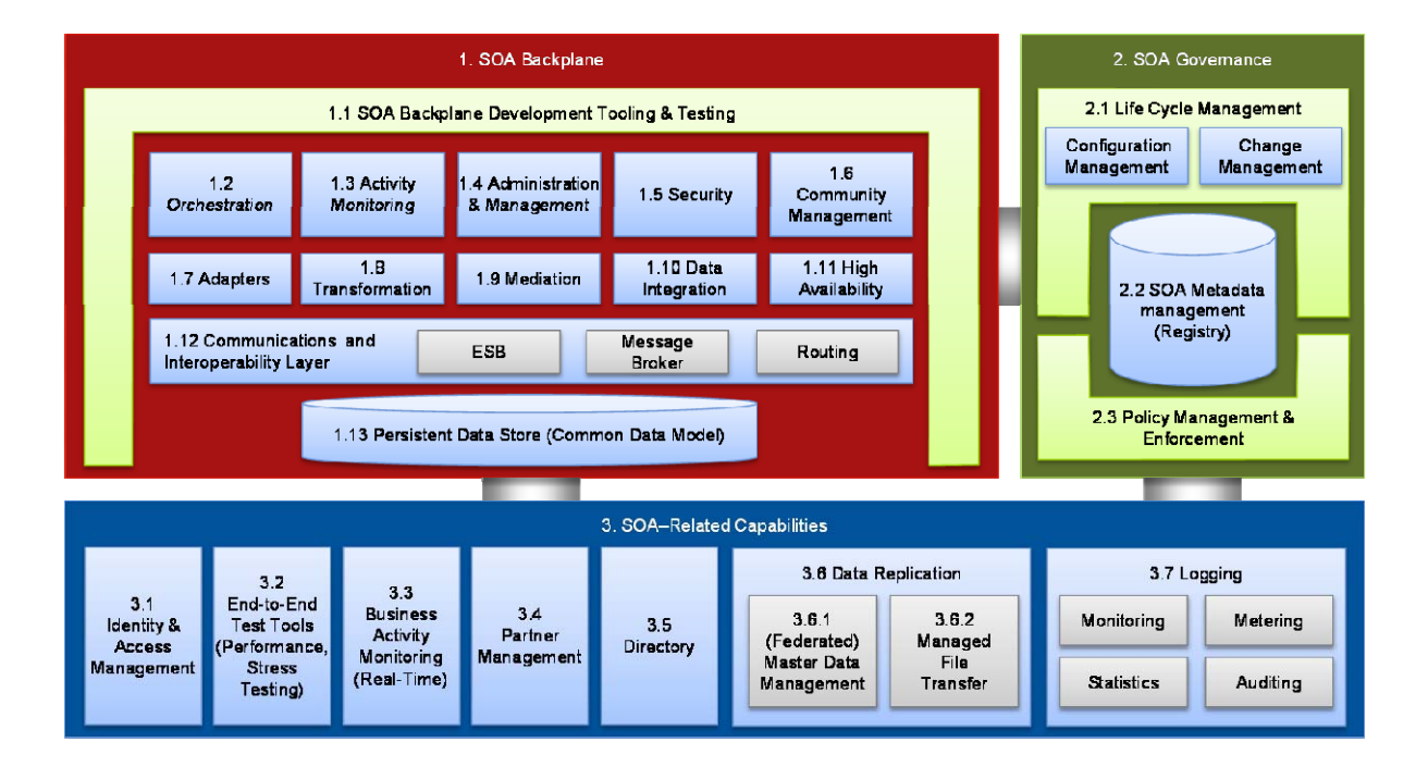
Figure 2: Envisioned CCN2 Platform Functional Break-Down

This section introduces the high-level functions of the CCN2 Platform. The envisioned functional break-down of the CCN2 Platform is provided in Figure 2 below.